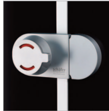
Aluminium one-hand door knob cubicle inside