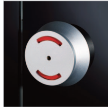
Aluminium one-hand door knob INSAFE cubicle outside