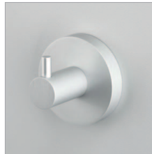
Aluminium hook Schäfer AL7010