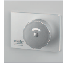
Nylon one hand door knob