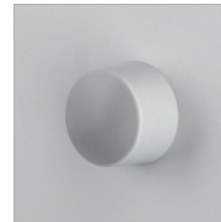
Nylon buffer Schäfer N8015