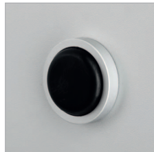
Aluminium buffer Schäfer AL7015