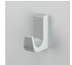
Nylon hook Schäfer N8010