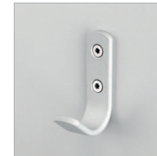
Aluminium hook Schäfer AL7011