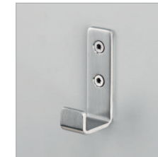
Stainless steel hook Schäfer ES6011