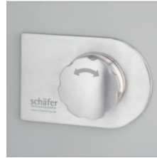
Stainless steel one hand door knob