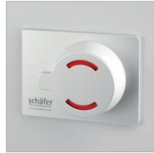
Aluminium one hand door knob INSAFE